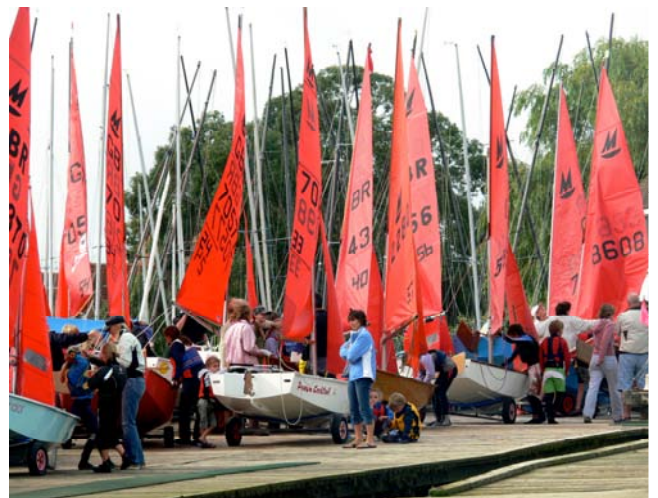
Junior Racing and Training