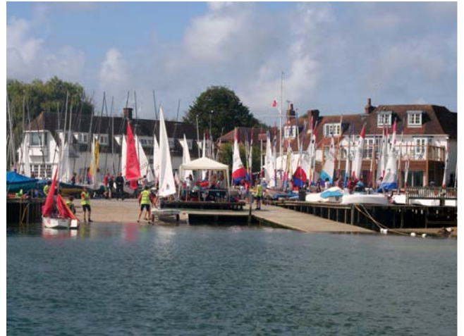
Great Socials and Facilities