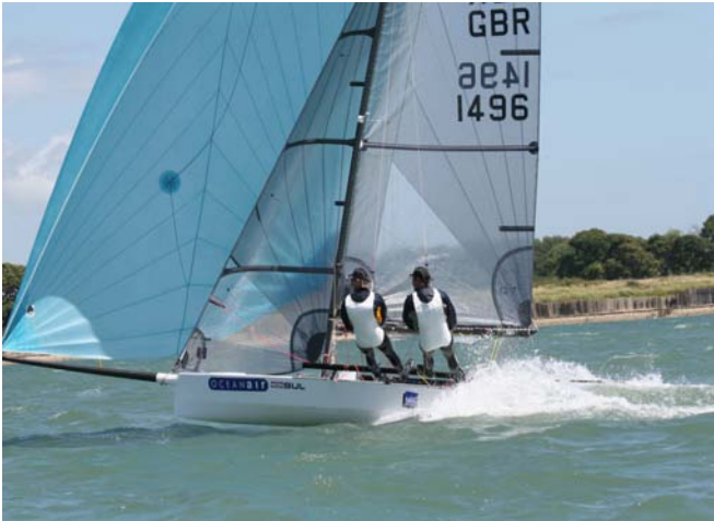
High Performance Dinghies