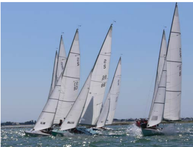
One Design Racing